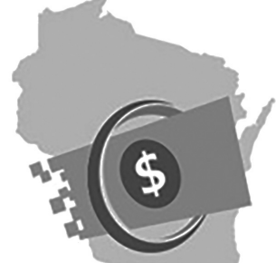
WisLoan + Telework

WisLoan is a federally-funded project of the National Institute for Disability and Rehabilitation, and a cooperative service of the Wisconsin Dept. of Health Services, IndependenceFirst, and BMO Harris Bank. ◆